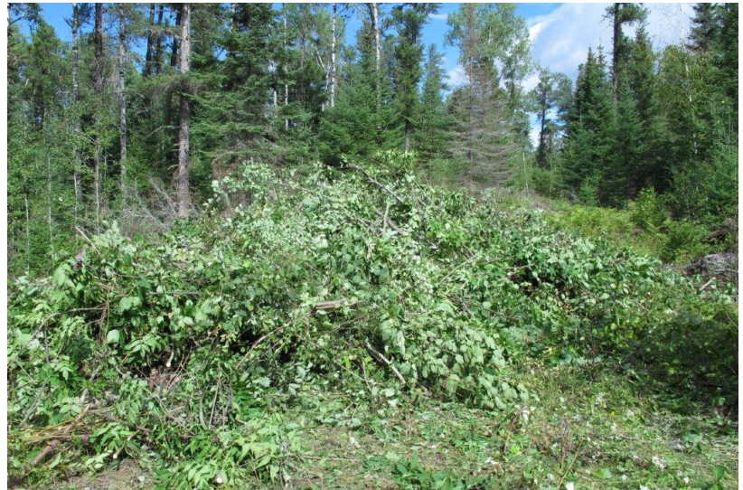
PILES OF BRUSH WERE CREATED!!