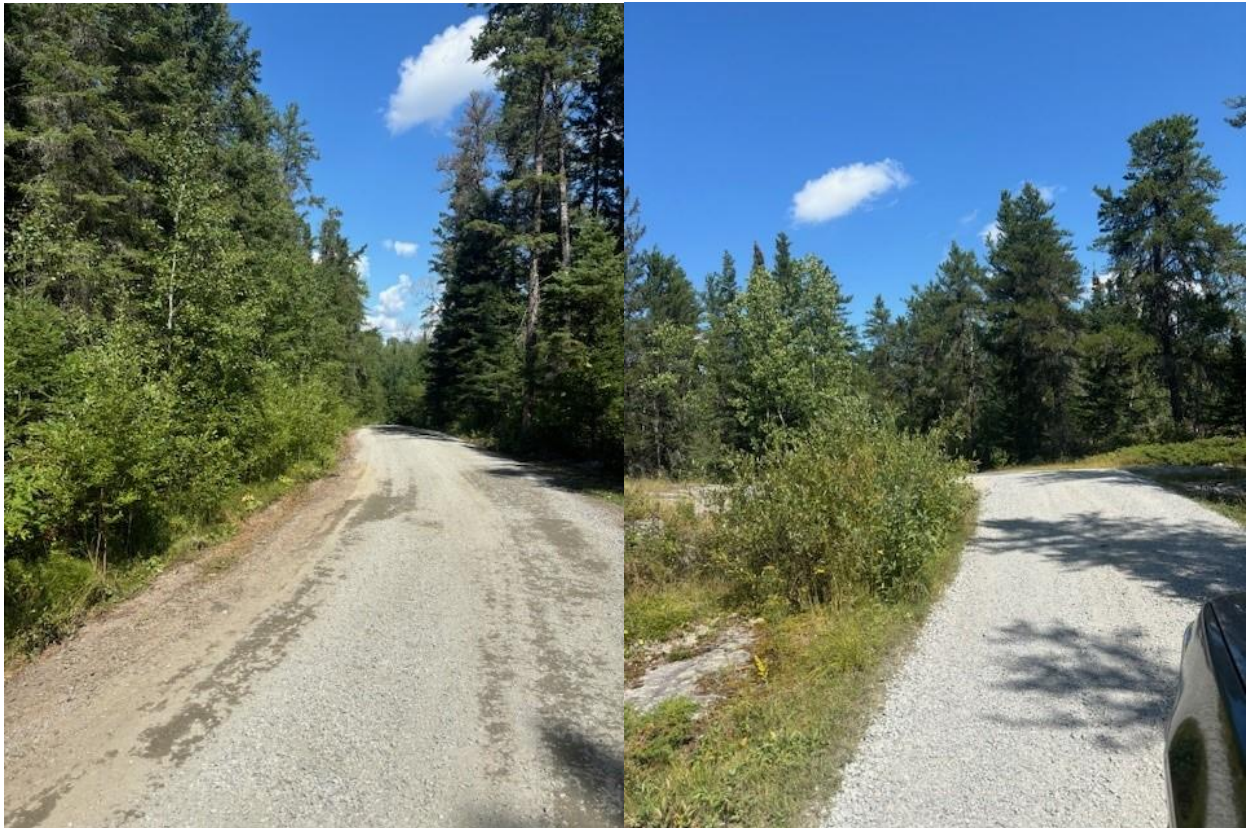
Thatcher Road Looking Smooth!!