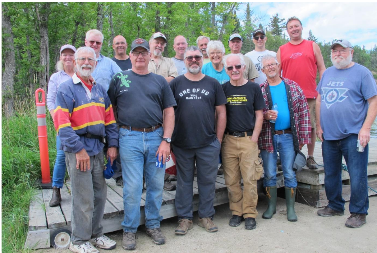
THE 2024 THATCHER ROAD WORK CREW!!