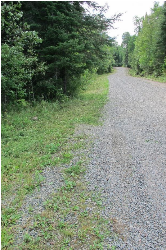
Thatcher Road looking Good!!